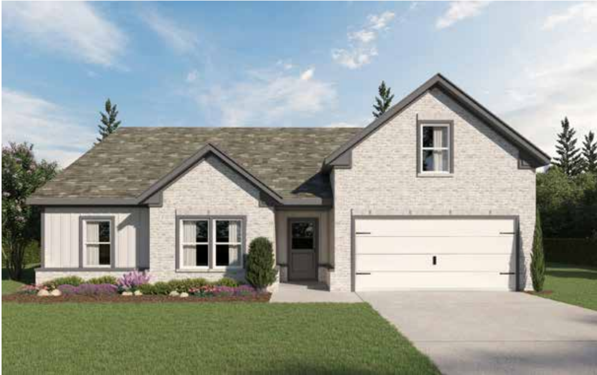
The Hansen A4